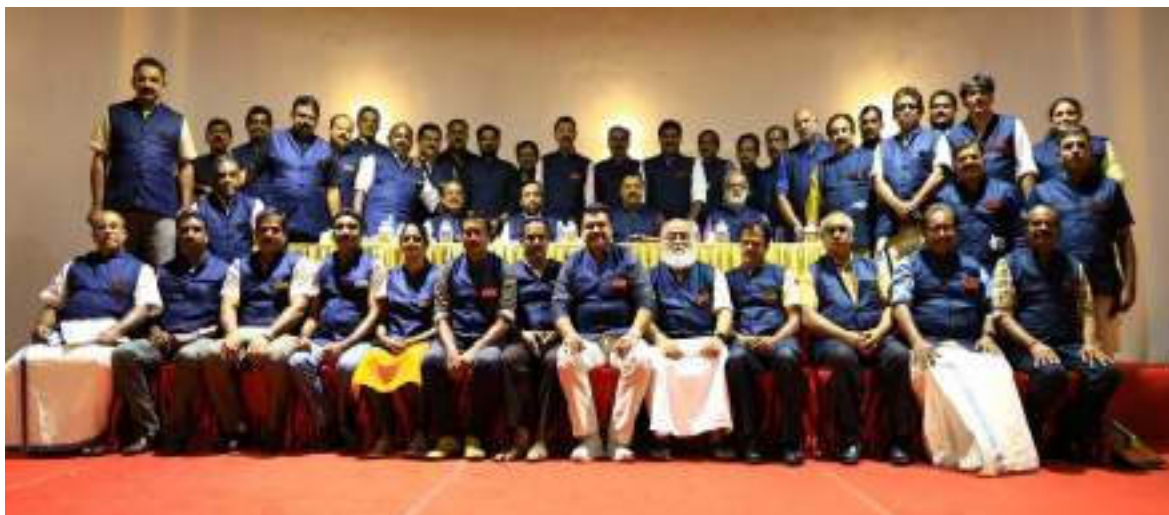
The General Council Members of KOA