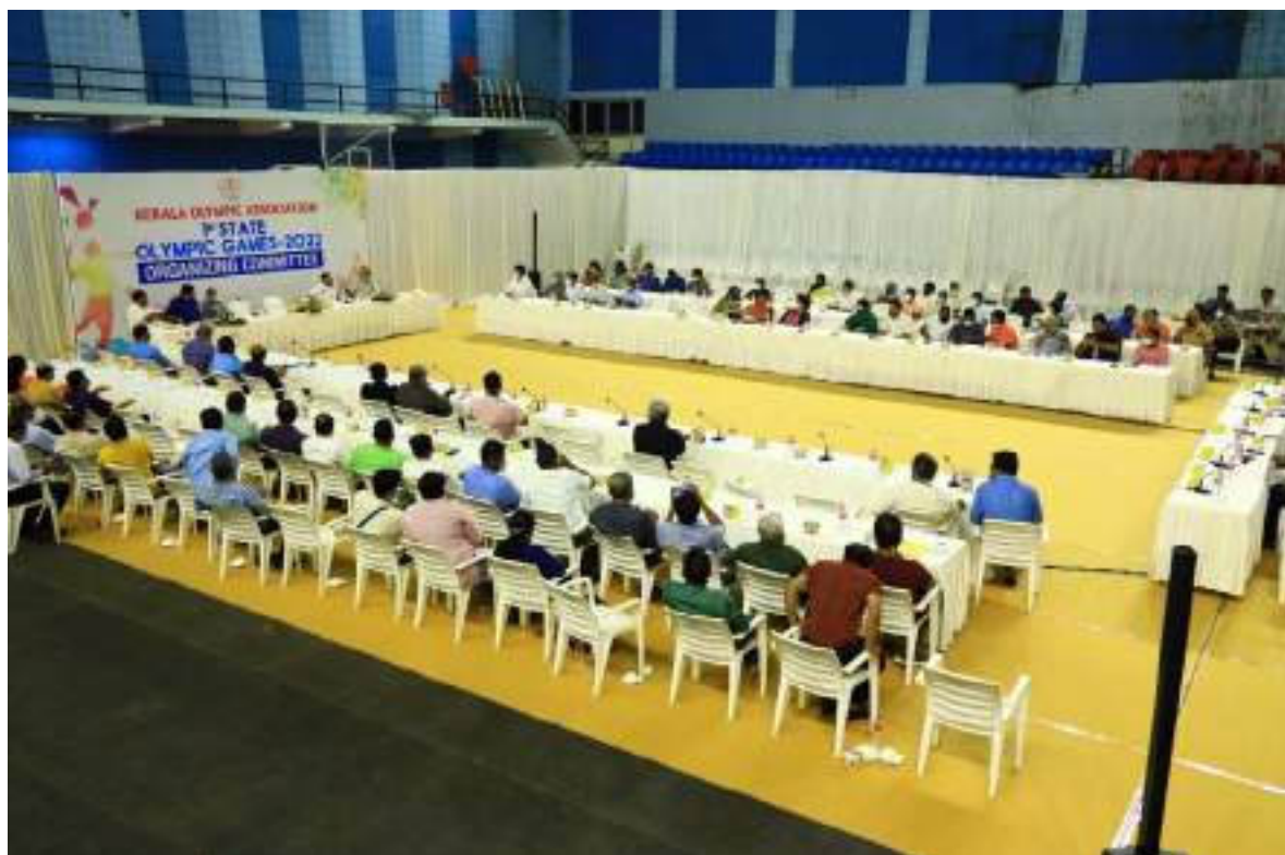
Kerala Games 2022 – Organising Committee Meeting