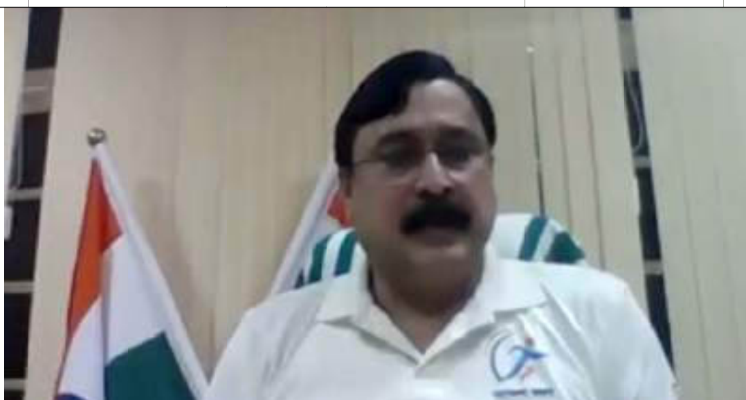
The Chairman of the function, Sri. V. Abdurahiman, Hon'ble Minister for Sports giving his Presidential Address