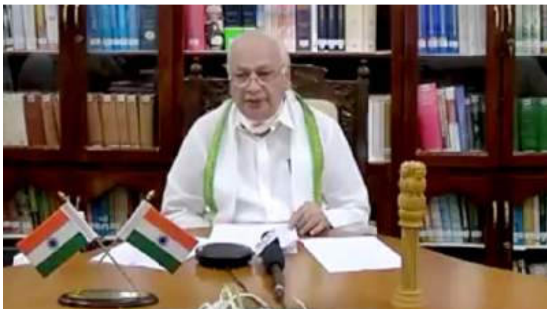
Sri. Arif Mohammed Khan, Hon'ble Governor of Kerala inaugurating the virtual function