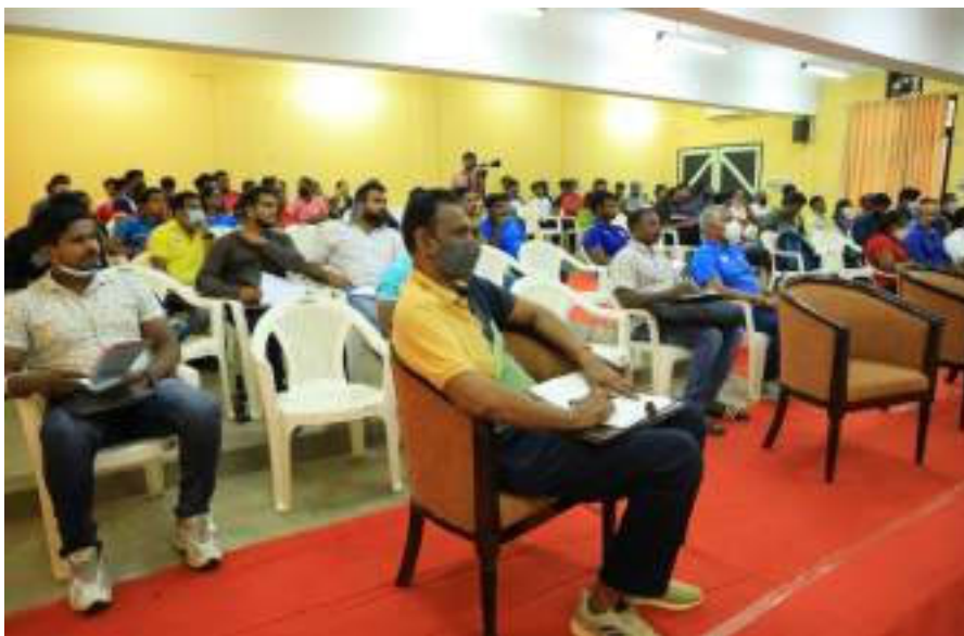
Coaches from various sports organisations attending the workshop