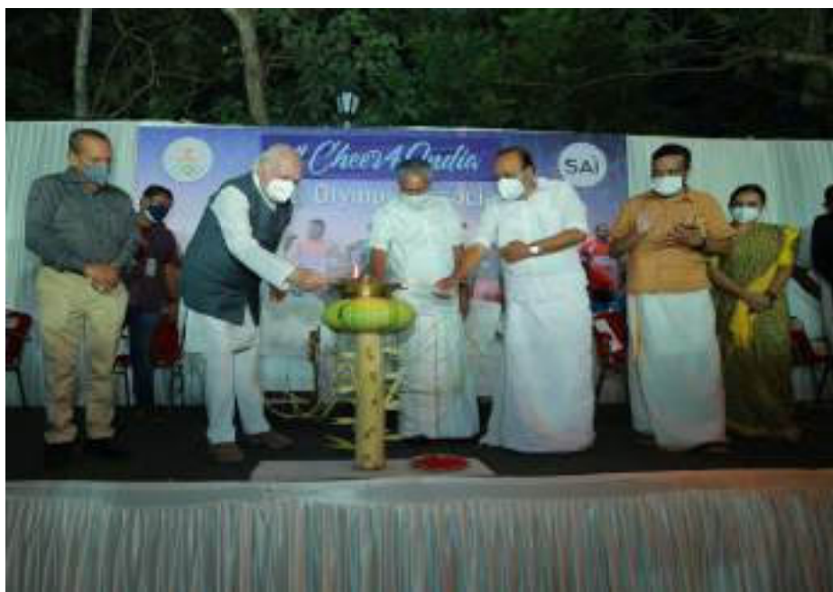
Hon'ble Governor of Kerala Sri Arif Mohammed Khan, Sri. Pinarayi Vijayan, Hon. Chief Minister of Kerala and Sri. V D Satheeshan, Hon. Leader of Opposition inaugurating the Olympic Light Ceremony by lighting the lamp together