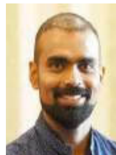
P R Sreejesh Field Hockey