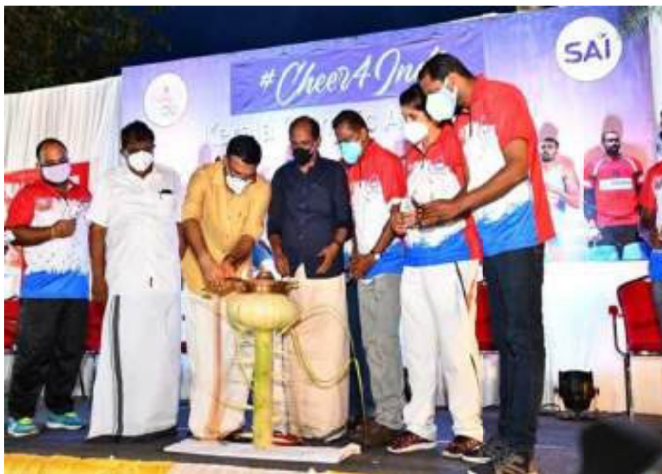
Sri. M B Rajesh, Hon. Speaker of Kerala Legislative Assembly inaugurating the Olympic light function in front of Secretariat by lighting the lamp

One more venue was there in front of Government Secretariat where the Honourable Speaker Sri. M B Rajesh, Sri. G R Anil, Minister for Food and Civil Supplies, Sri. Antony Raju, Minister for Transport, were present.