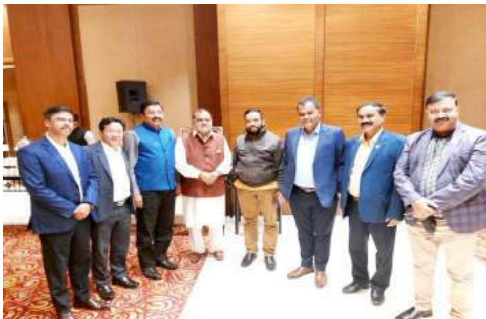
The President and Secretary General of KOA with Sri. Narinder Dhruv Batra, President, IOA and other officials