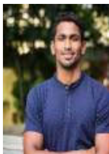
Sajan Prakash Swimming