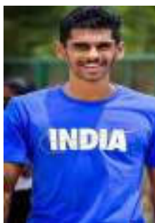
Murali Sreeshankar Men's Long Jump