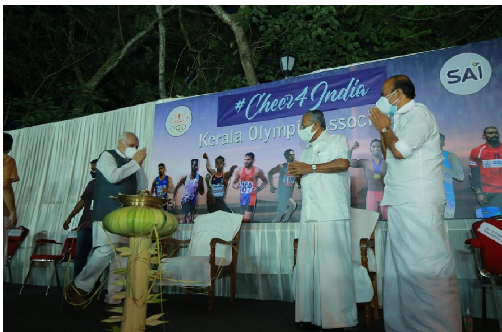
Hon'ble Governor of Kerala Sri Arif Mohammed Khan arriving for the Olympic Light Ceremony. Hon. Chief Minister of Kerala Sri. Pinarayi Vijayan and Hon Leader of Opposition Sri. V D Satheesan greeting the Governor

The major event envisioned by the Kerala Olympic Association was “Olympic light” lighting event on 22nd July at 7pm. We appealed to the entire people of the State to switch off the electric lights and kindle candles / oil lamps / mobile torches at 7pm to stand in solidarity to the Indian Athletes particularly to the Keralites attending the Olympic Games. The program was a tremendous success and great motivation for the athletes participating in the Olympic Games at Tokyo.