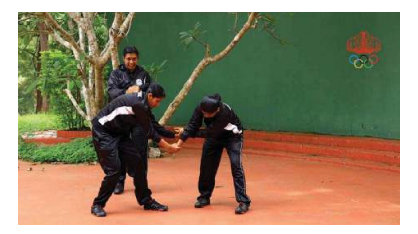
Self defence program demonstration