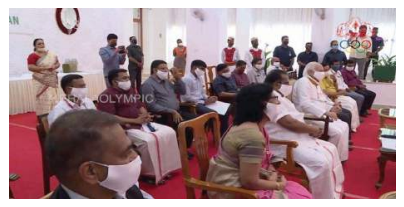
Olympic Day Celebrations