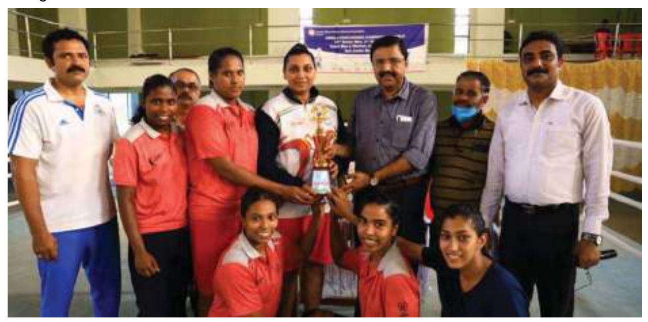
53<sup>rd</sup> Boxing Championship

78 Boxers from 14 districts Viz. Thiruvananthapuram, Kollam, Pathanamthitta, Alappuzha, Kottayam, Idukki, Ernakulam, Thrissur, Palakkad, Kozhikode, Wayanad, Malappuram, Kannur and Kasaragod, Competition was held in 13 weight categories. held in 10 weight categories.