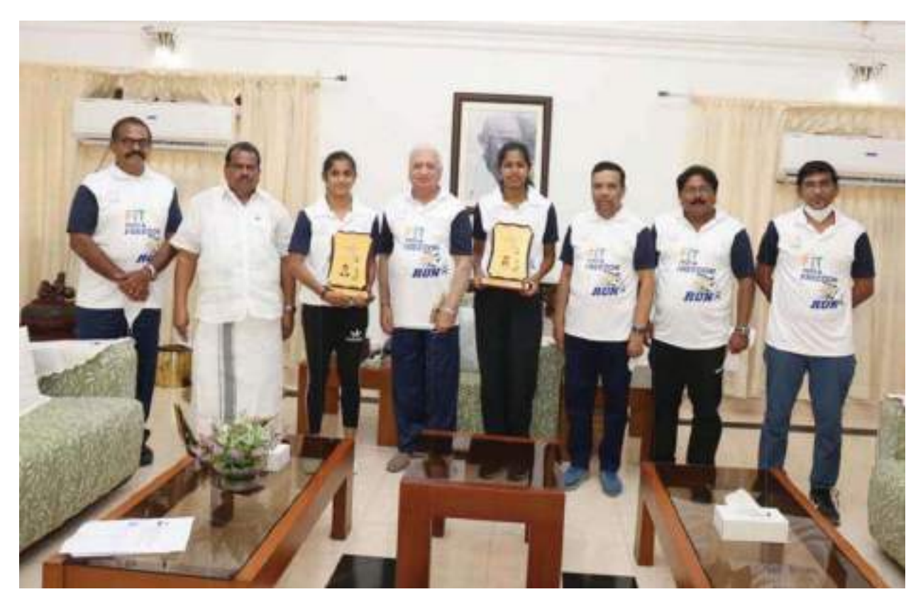
Fit India Freedom Run Commemoration ceremony at Raj Bhavan on the occasion of National Sports Day