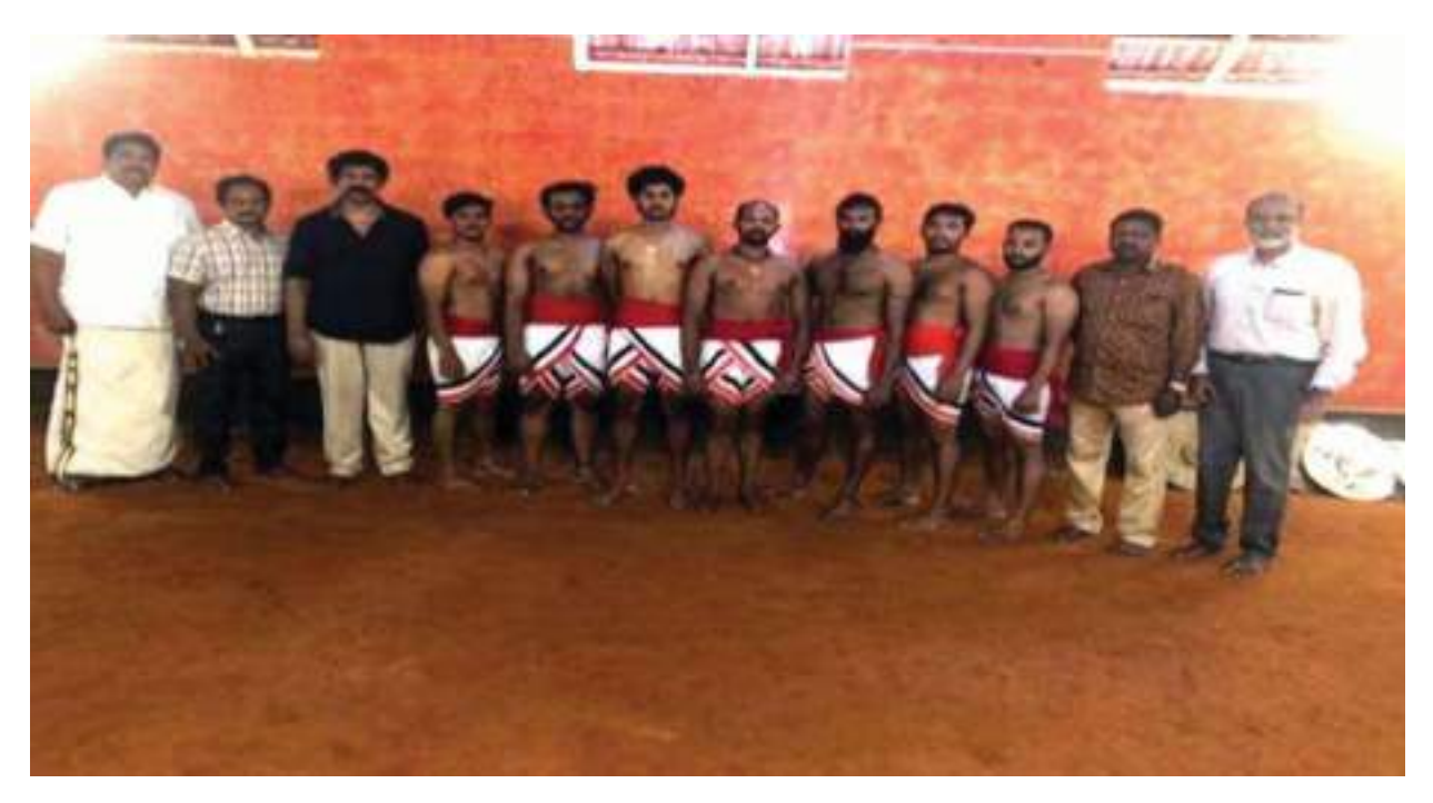
DOA Oraganized Kalaripayattu show as the part of the celebrations

DOA Kottayam celebrated the Olympic day on 23<sup>rd</sup> June 2020. The main attraction was the Kalaripayattu demonstration at Kottayam, before the invited guests, keeping the Covid protocol. DOA made a short video presentation of the programme with messages from the celebrities and MLAs in Kottayam District. The video clip was aired through various local cable TV channels.