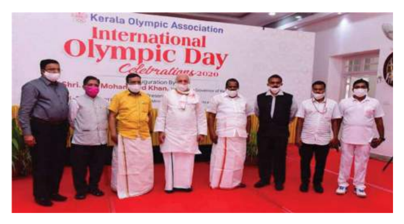
Sri. Arif Muhammed Khan, Hon'ble Governor, Sri. E.P Jayarajan Hon'ble Minister for sports, along with the other participants of the function.