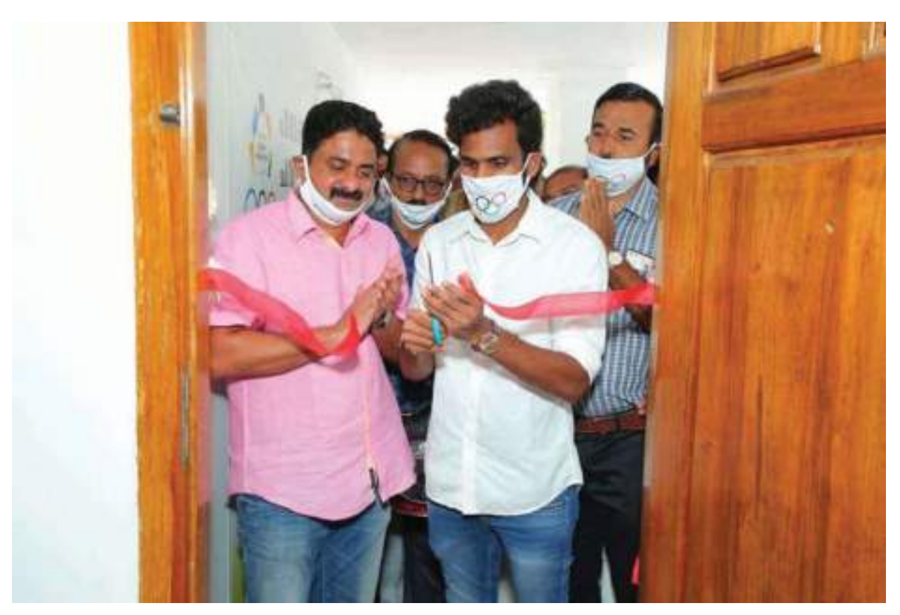
Inaguration of District Olympic office at Palakkad by Indian International Footballer C K Vineeth