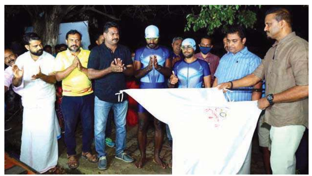
Olympian Anilkumar Inaugurating Triathlon