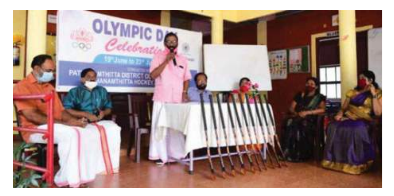
Distribution of Hockey Sticks