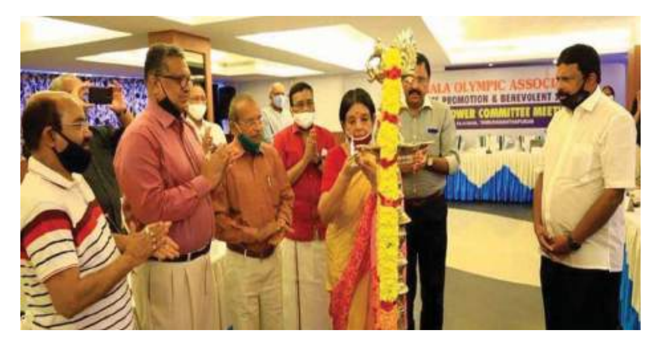
HH Princess PooyamThirunal Parvathy Bayi Lights the lamp Inagurating the ceremony