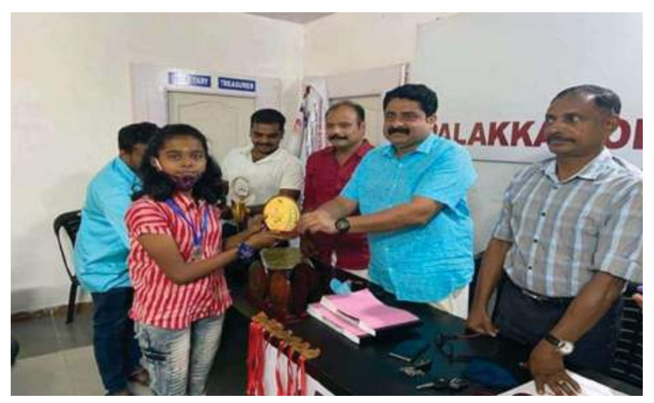
Honouring the winners in State Boxing Championship

The distribution of sports kits to children in tribal villages in Palakkad district is also in progress.