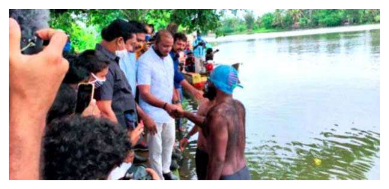
Olympic day Celebrations at Allapey