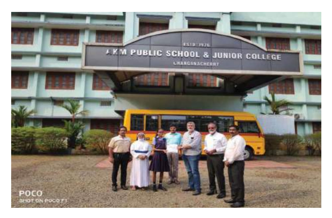
Stay fit winners T-Shirt distibution

Stay Fit programme had become a super hit programme in Kottayam District. There are 117 CBSE Schools and 17 ICSE Schools in Kottayam and all the schools made use of the programme and the schools had a healthy competition among themselves to take part in the quiz competition after every episode. Often 75% of the prize winners are from Kottayam. We could make it a grand success with the active co-operation of the Principals and Managers Association of the CBSE and ICSE Schools.