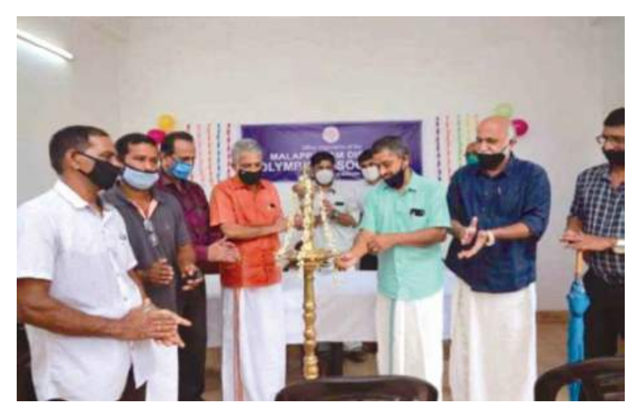
Inaguration of District Olympic offce at Malappuram