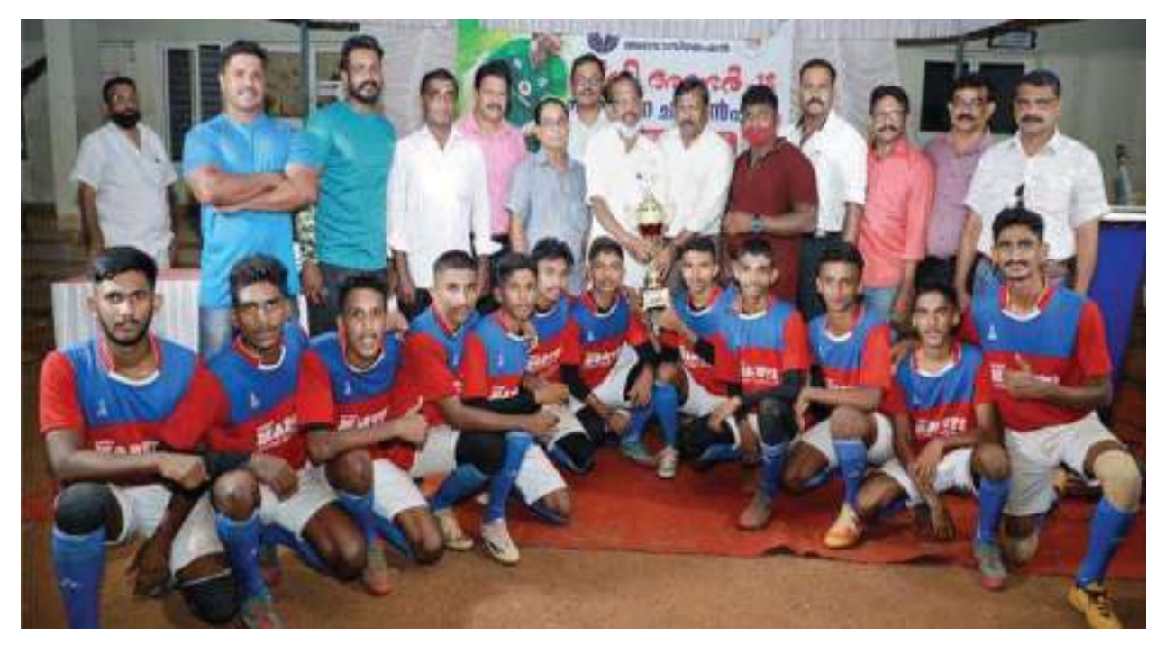
Under 18 championship boys

Conducted webinar - Referees Refreshers Session on 8<sup>th</sup> June 2020 in Zoom. Conducted webinar – Coaching Children on 19<sup>th</sup> July 2020 in Zoom. Conducted coaching camp at St' Michael's Anglo-Indian HSS, Kannur from 25<sup>th</sup> to 4<sup>th</sup> February. Rugby instructors' course was conducted at Wayanad on 5<sup>th</sup> February 2021 and Rugby Ready course at Wayanad on 6<sup>th</sup> February 2021. Conducted coaching camp at Mambaram HSS, Kannur from 9<sup>th</sup> to 25<sup>th</sup> February 2021