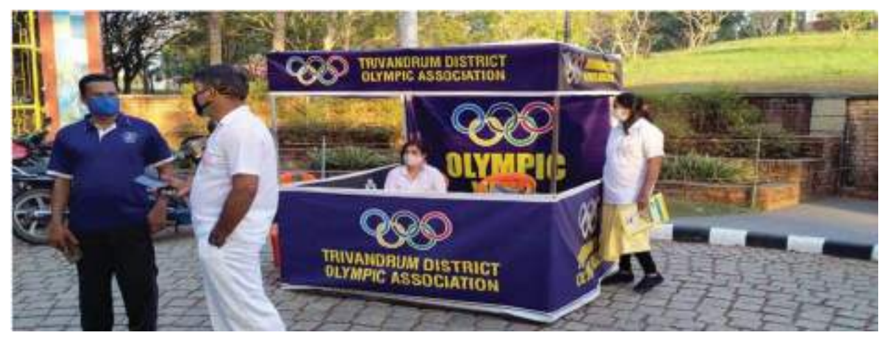
Olympic wave Campaign