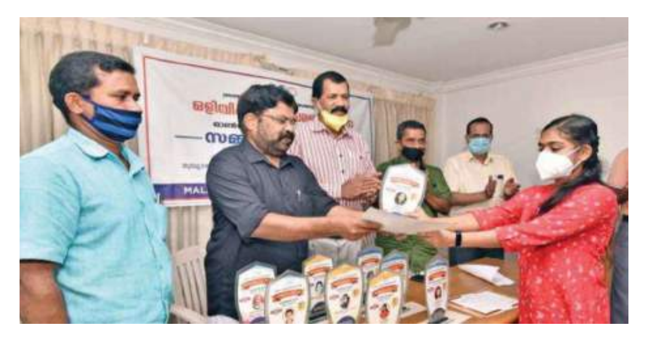
Distributing trophies and certificates to the winners of Olympic Day Quiz Programme in Malappuram