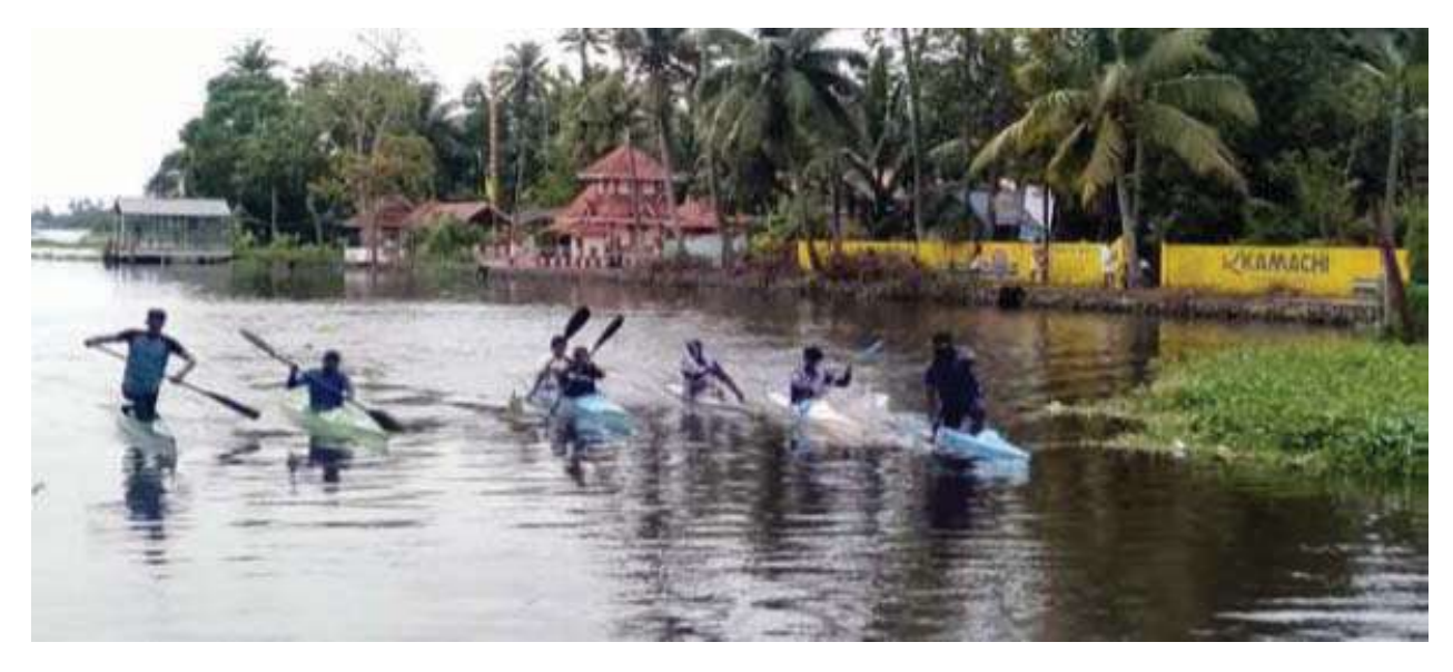
A view of triathlon, canoeing & kayaking events at Punnamada Lake Alleppey during the Olympic Day Celebration