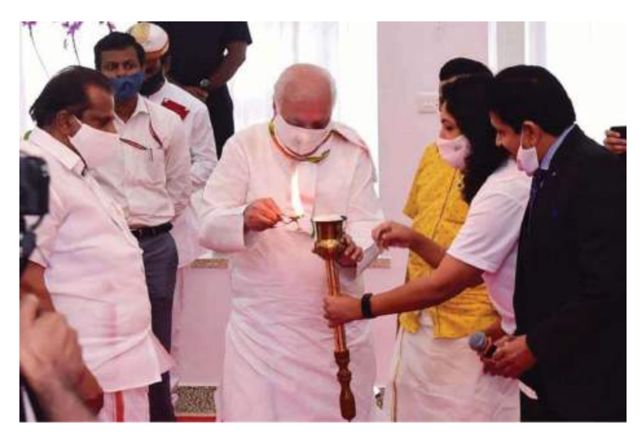
Sri. Arif Muhammed Khan, Hon'ble Governor Lighting the Olympic Torch

In the light of pandemic situation the International Olympic Committee and Indian Olympic Association has instructed to limit the celebrations without huge crowd and assembly of people in large number. Olympians, Sports celebrities and sports trainers were advised to confine their activity inside home or training centres and to use electronic and visual media to reach people. The theme was "stay-strong, stay-active and stay-healthy"