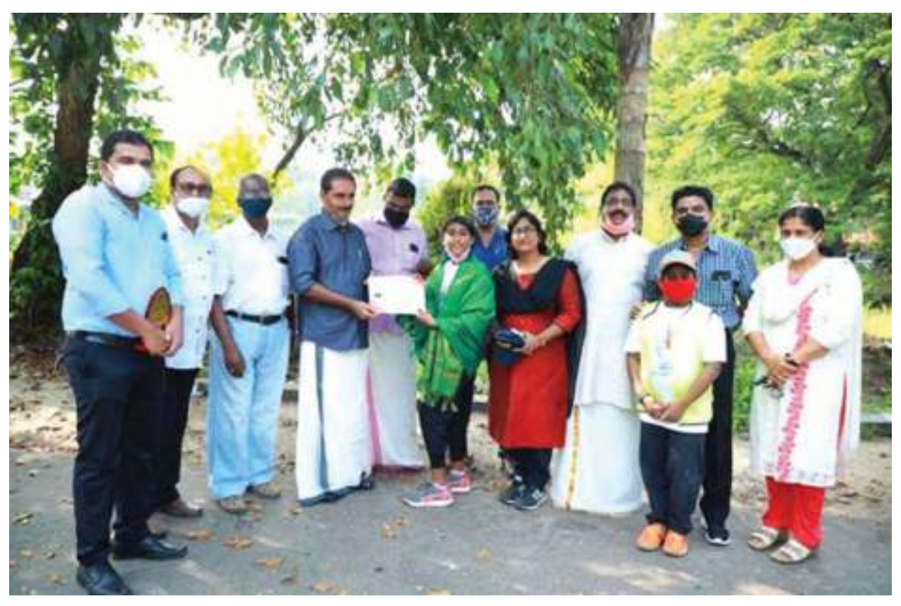
Sree N K Premachandran MP, distributing the Certificates

In connection with the International Olympic Day Celebration, the Kollam District Olympic Association AdhocCommittee organised an Art & Drawing competition for students under the age group of below-15 and above-15 on June 23<sup>rd</sup> 2020.