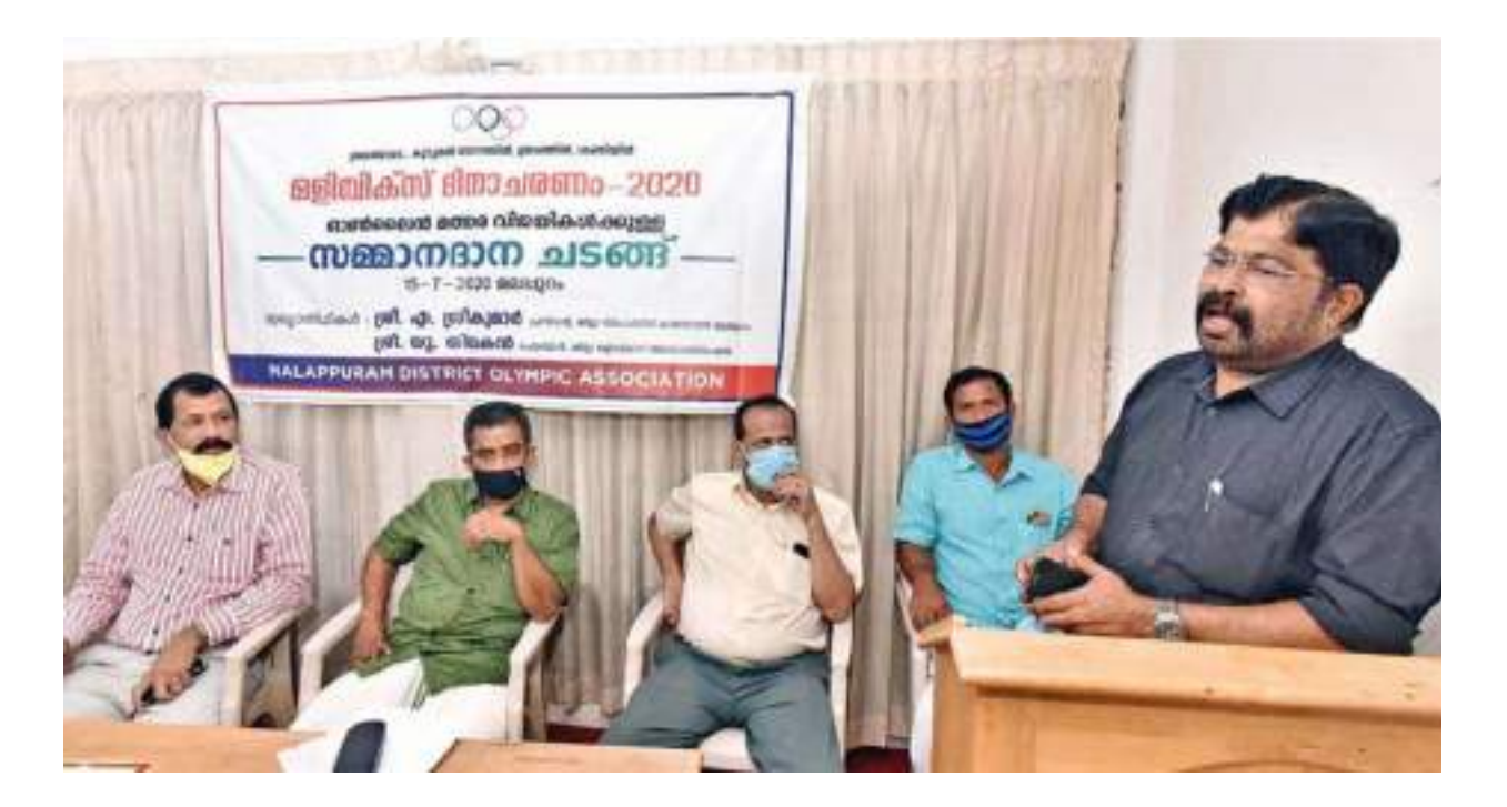
Inaguration of Olympic Day Celebration

Several programmes were organised in connection with Olympic Day celebration on June 23, June 23, 2020. An online quiz programme was conducted for school/collage students in different categories. On June 22 another online competition on poster making was organised for the students. On 23<sup>rd</sup> June a Cycle Rally was organised with the help of District Hockey Association. The prizes to the above competitions were distributed in a meeting arranged at Malappuram Indore Stadium on 15/7/2020.